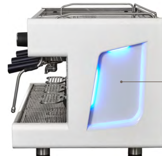
CUSTOMIZABLE AND REMOVABLE SIDES PANELS