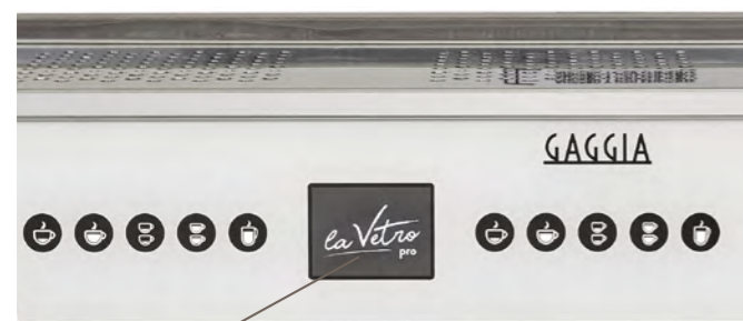
TFT 2,8" display